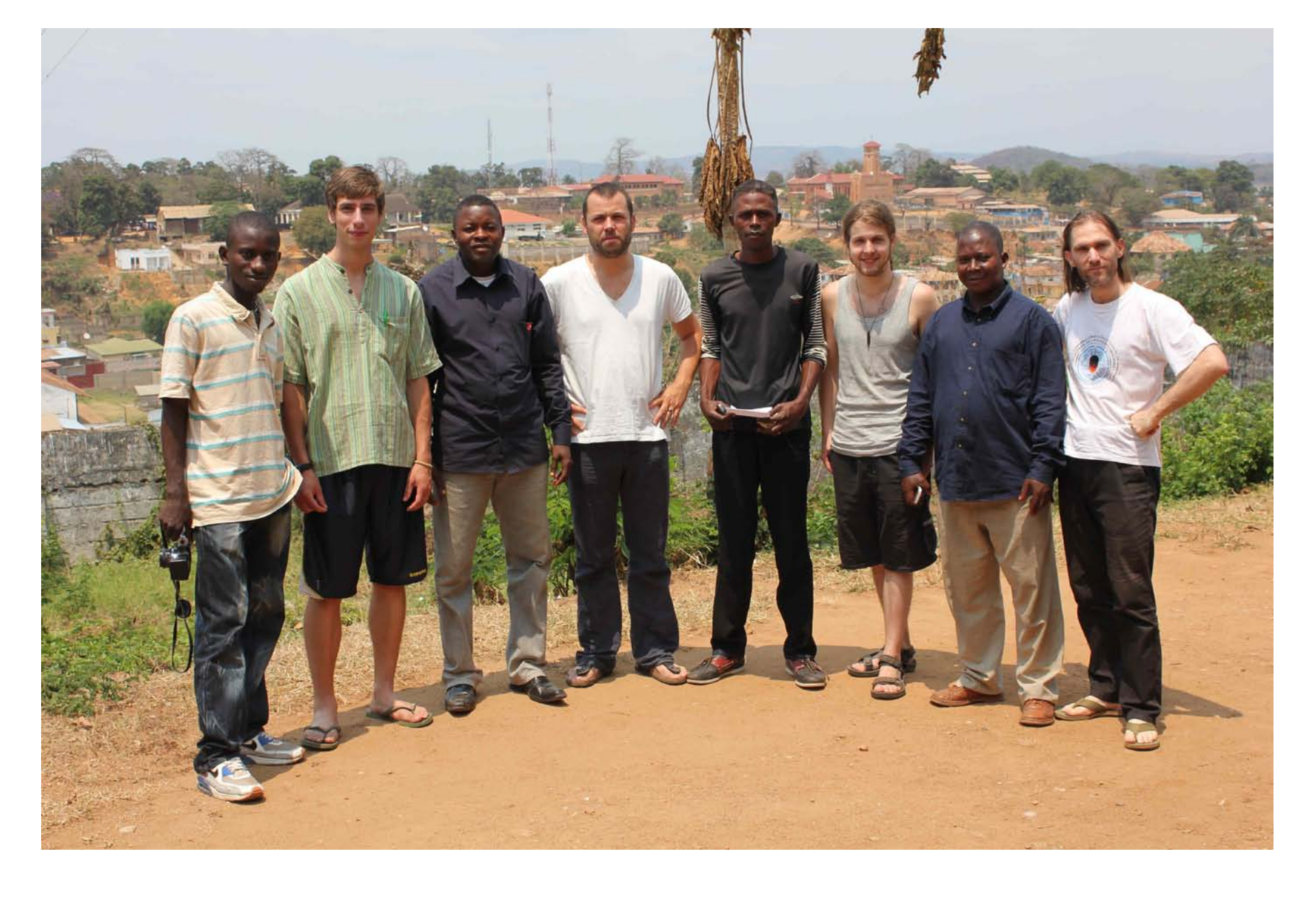
The four of us in Boma....