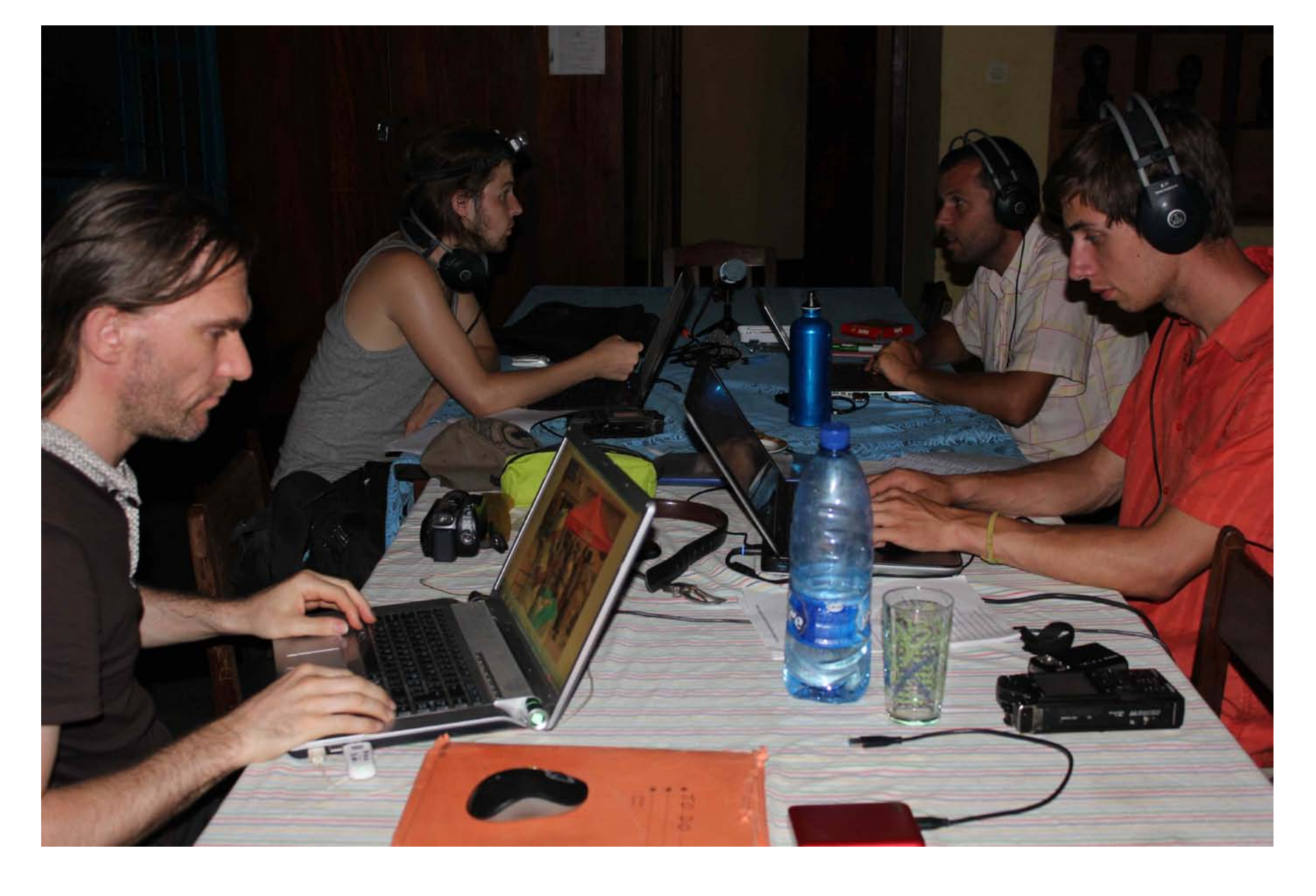
...working until late at night!